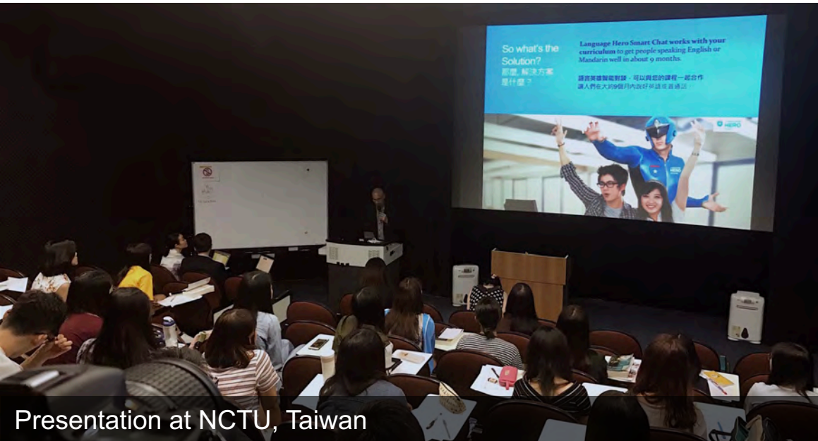
Presentation at NCTU, Taiwan