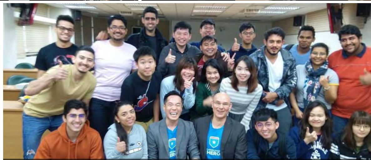
Yuan Ze University Foreign Engineering Students after testing App