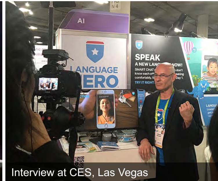
Interview at CES, Las Vegas