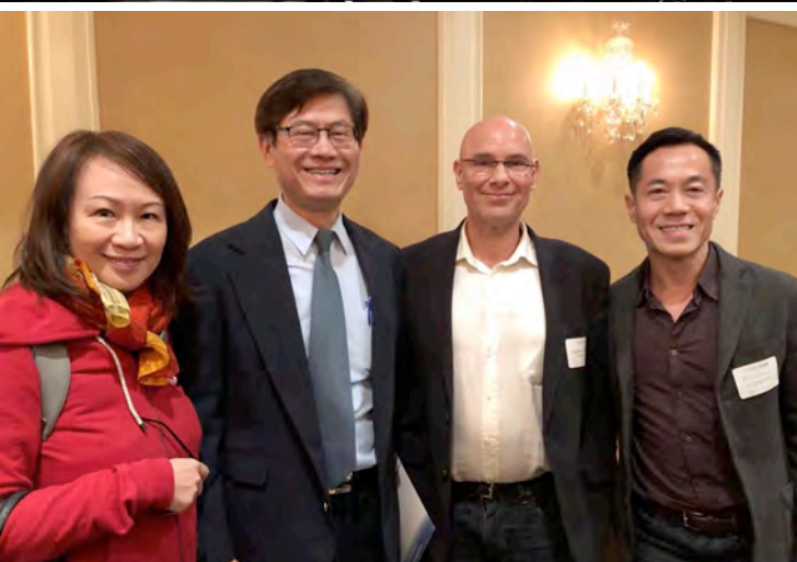
With Taiwan's Minister of Science & Technology